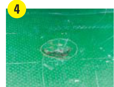
4 With the ding exposed, it is easy to see how much of the fiberglass skin must be removed for the repair.