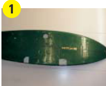
1 This surfboard has seen better days!

This repair can be done in about one hour with under $20 in supplies!