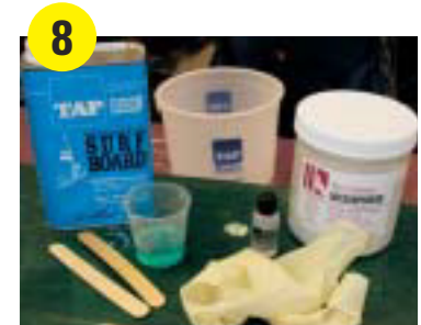
8 Assemble the materials you will need – mix Microspheres and Surfboard Resin to make a resin foam to fill the hole.