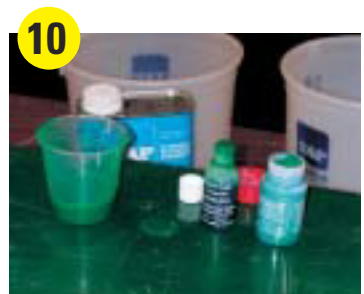
10 For small dings, resin without glass can be used for repair. If you do not plan to paint the board, use pigment and dye to color match the resin. Fill balance of hole to slightly above the surface.