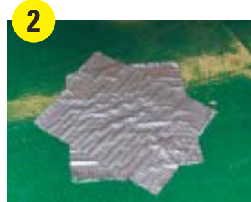
2 Duct tape may work in an emergency. But it is ugly and water can still leak into the foam core of the board.