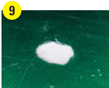
9 Pour the "resin foam" into the hole just to the bottom of the fiberglass skin. Resin will gel in about 10-15 minutes.