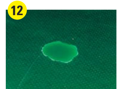
12 Buff out the area with 3M fiberglass restorer or any rubbing compound and repair is complete. Color match here is off, but the repair is undetectable to the touch.