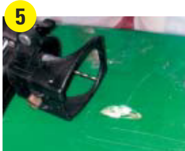
5 A rotozip or dremel can be used to remove the damaged fiberglass.