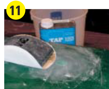
11 Once cured, sand smooth with successive or its of sandpaper.