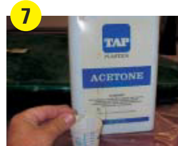
7 Remove a piece of the foam core and place in Acetone. If nothing happens, use Surfboard Resin for repair. If foam dissolves, use epoxy.