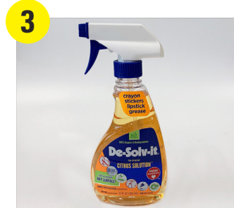
3 Removing the duct tape can be the first challenge. Use De-Solv-It for easy adhesive removal.